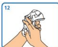
12 Dry thoroughly with a single-use towel