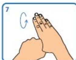
7 Rub each thumb clasped in opposite hand using a rotational movement