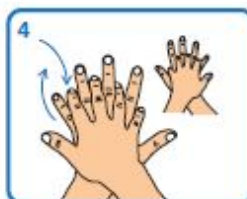
4 Rub back of each hand with palm of other hand with fingers interlaced