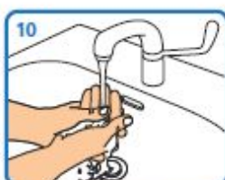
10 Rinse hands with water