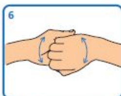
6 Rub with back of fingers to opposing palms with fingers interlocked