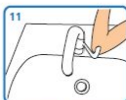
11 Use elbow to turn off tap