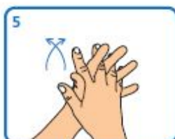
5 Rub palm to palm with fingers interlaced