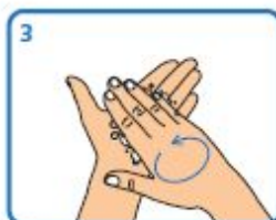
3 Rub hands palm to palm