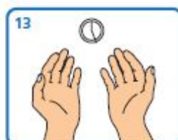
13 Hand washing should take 15–30 seconds