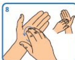
8 Rub tips of fingers in opposite palm in a circular motion