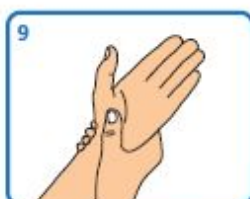
9 Rub each wrist with opposite hand