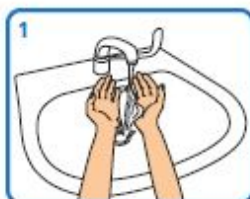
1 Wet hands with water