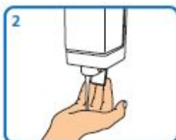
2 Apply enough soap to cover all hand surfaces